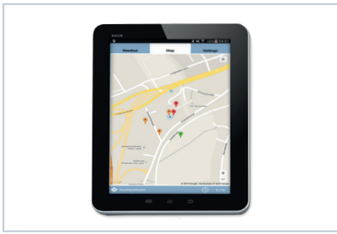
MEx Tablet (map view)