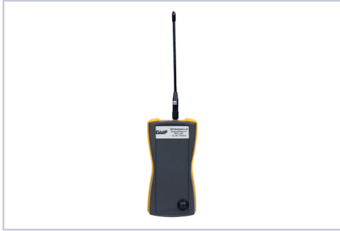
Radio receiver MBW BLUE